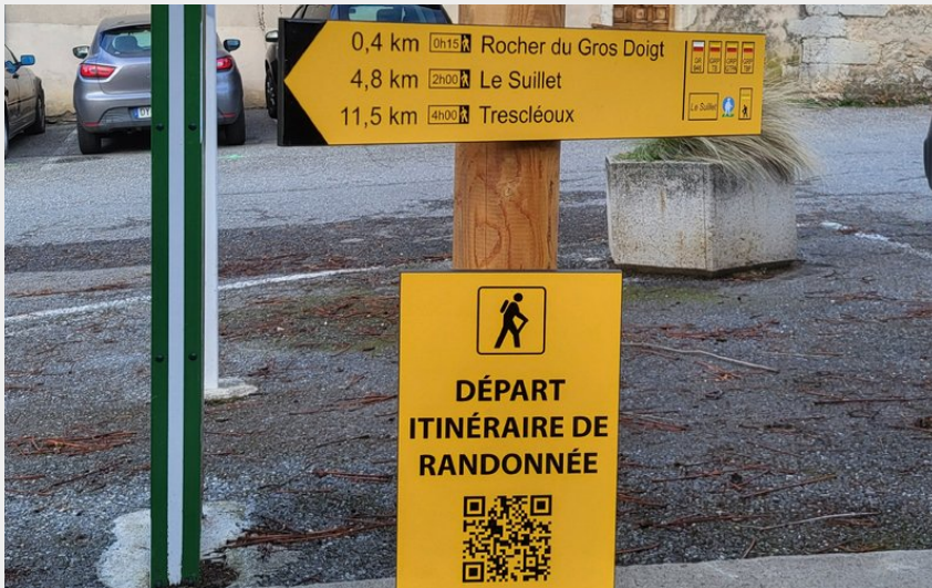
Centre d'Orpierre (CCSB)