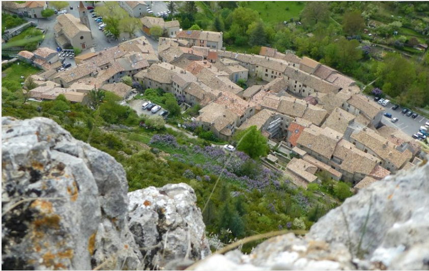
Vue plongeante sur le village d'Orpierre (CCSB)