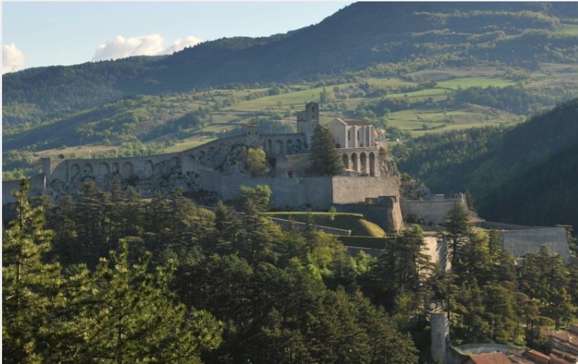
Citadelle Sisteron (CCSB)