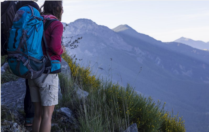
Sur les hauteurs du village de Saint-Genis (Martin Champon)