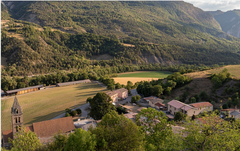
Village de Bayons (Martin Champon)