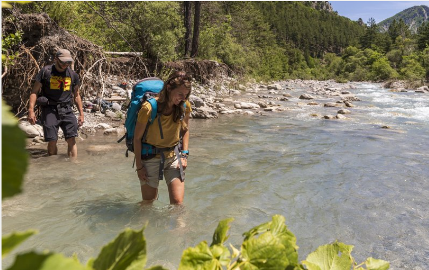
Au bord du Sasse