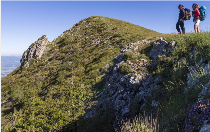
Sommet du Trainon (Martin Champon)