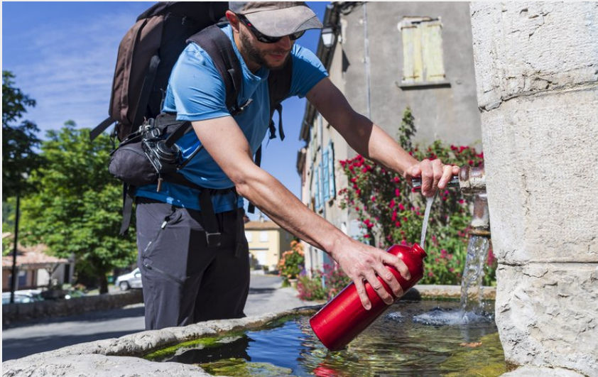
Fontaine du village de Saint-Geniez (Martin Champon)