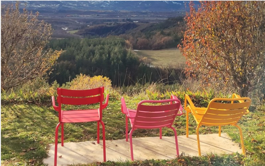
Village de Valernes (CCSB)