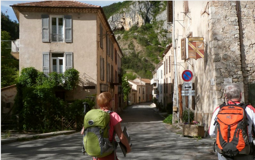
Village d'Orpierre (CCSB)