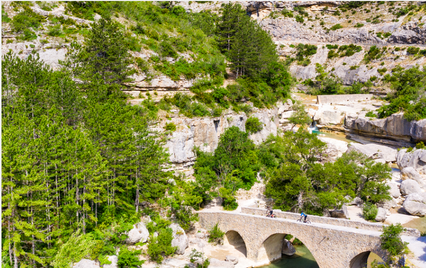
Gorges de la Méouge (Remi Fabregue)