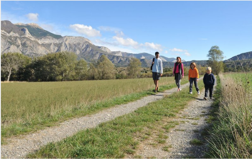
Autour de Savournon (CCSB)