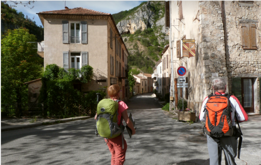
Village d'Orpierre (CDRP05)