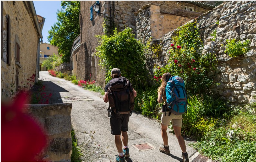
Ruelles du village d'Éourres (Martin Champon)