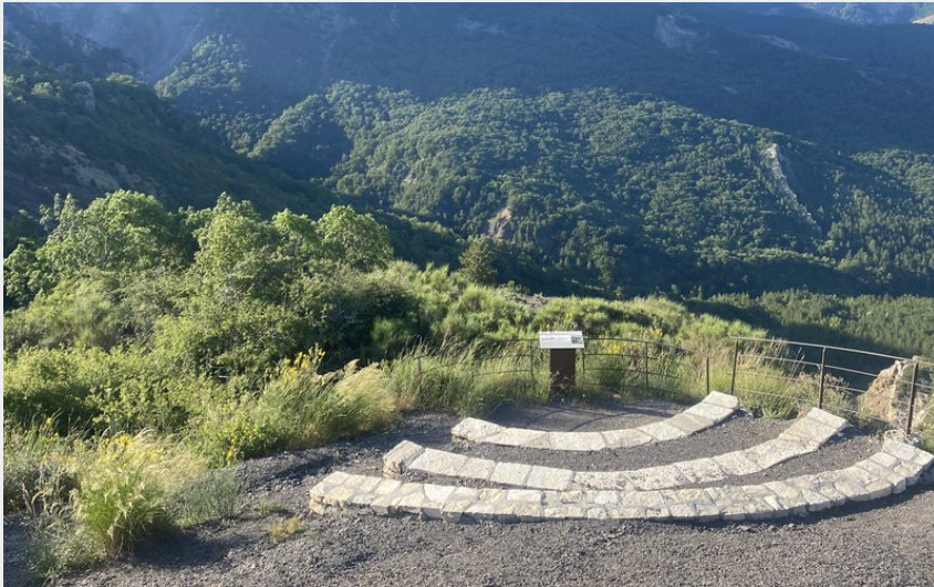
Point de vue (CCSB)