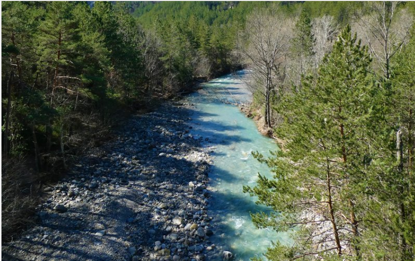
Vue depuis le pont de la Reine Jeanne (CCSB)