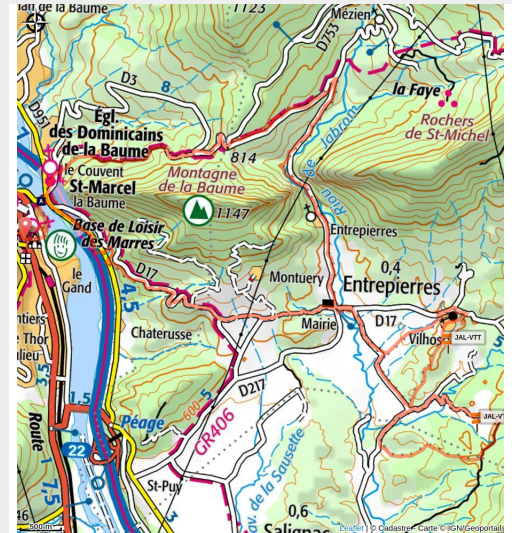
Passage sur passerelle (CCSB)