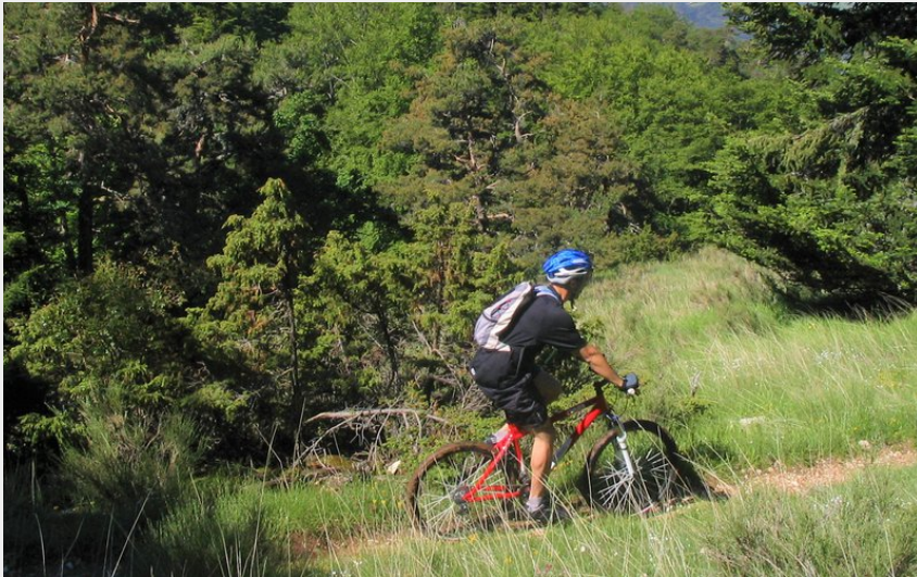
En pleine nature, dans le Val d'Oule (CCSB)