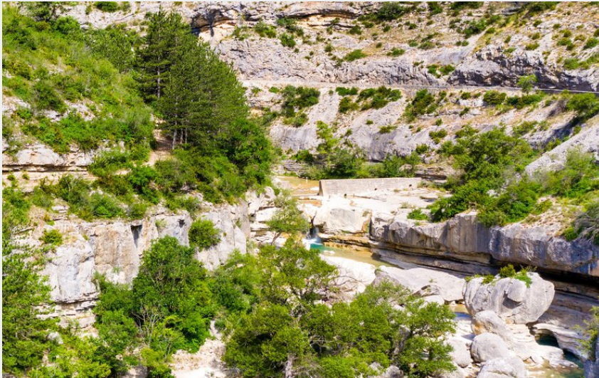
La Méouge (Remi Fabregue)