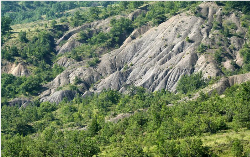
Les marnes entourant Ribiers (CDRP 05)