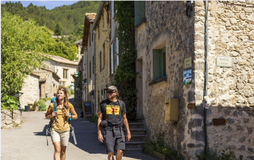
Village d'Eourres (Martin Champon)