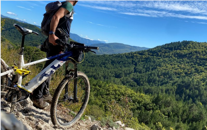
Paysages du Sisteronais (CCSB)