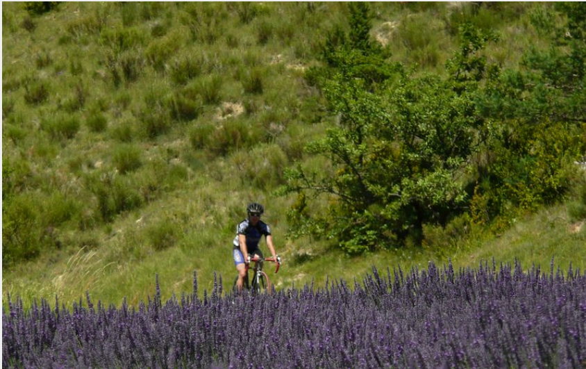
Passage dans les lavandes (CCSB)