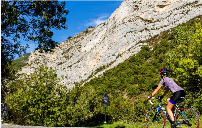
Village d'Entrepierres (CCSB)