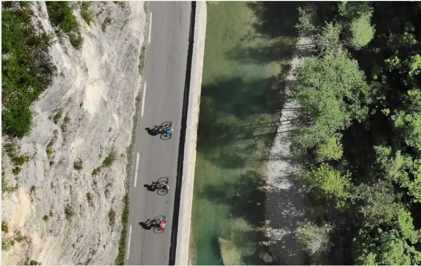
Gorges de la Méouge (CCSB)