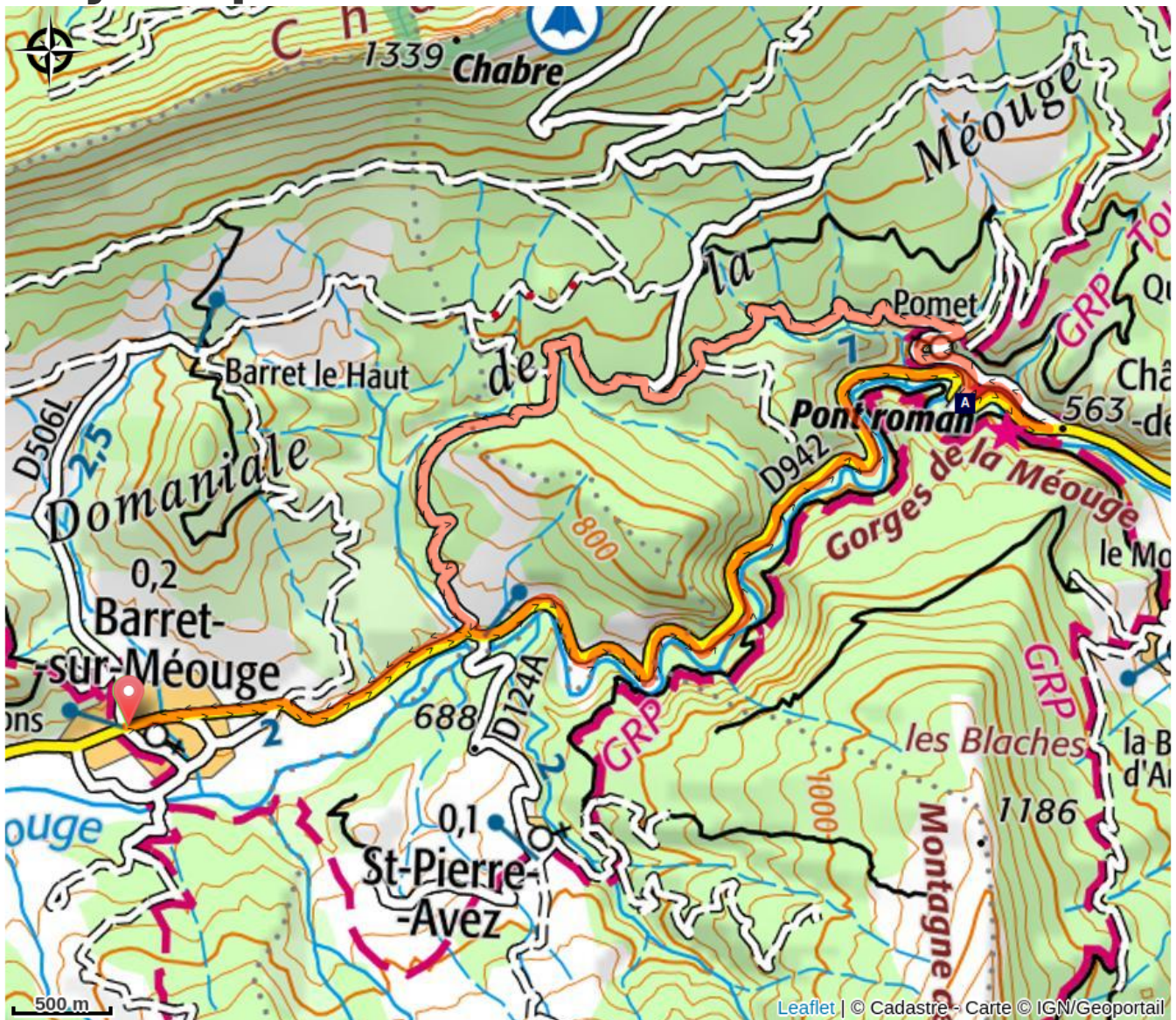
📍 The Méouge canyon (A)