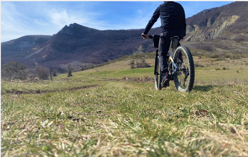
Paysage dégagé autour d'Éourres (CCSB)