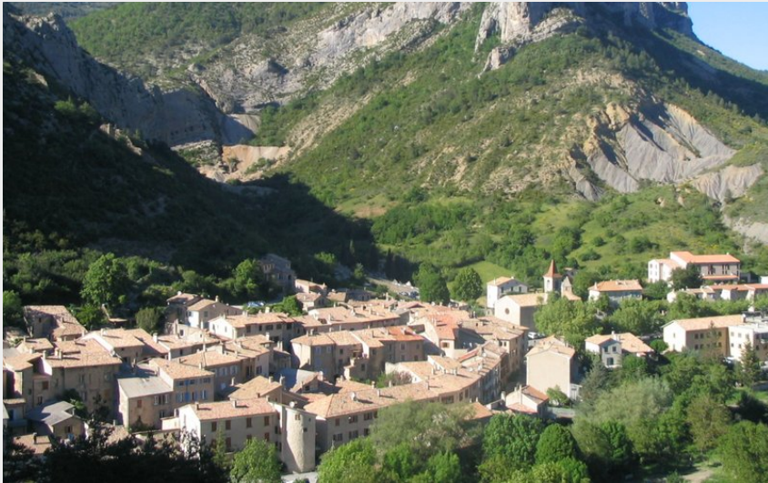
Village d'Orpierre (CCSB)