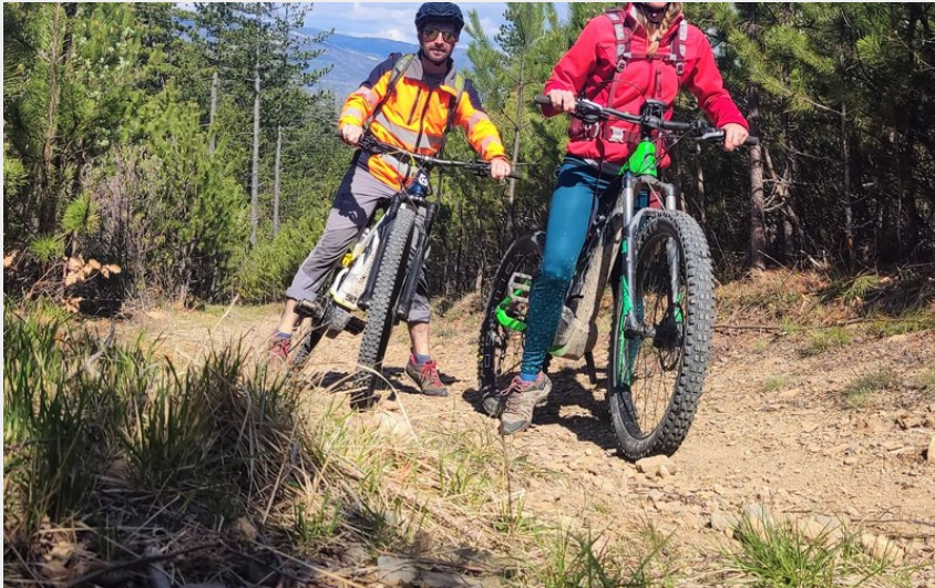
Sentier grim pant sur les hauteurs de Laragne (CCSB)