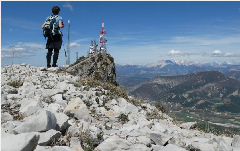
Sommet du Rocher de Beaumont (CCSB)