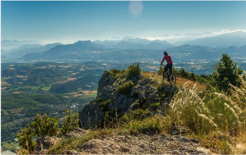
Depuis les hauteurs de la Montagne de Chabre (CCSB)