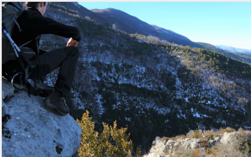
Un paysage appréciable (CCSB)