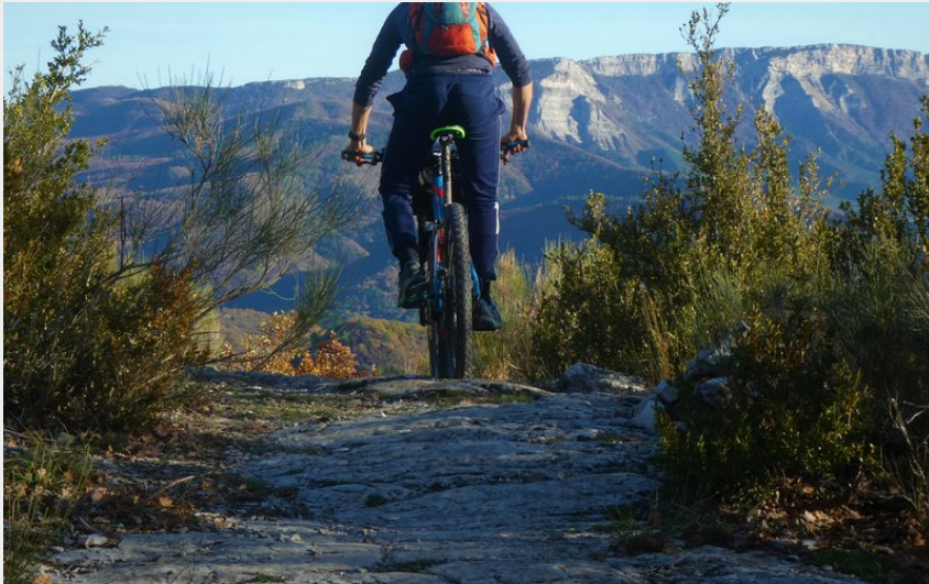
Paysages sauvages autour de la montagne de l'Ubac (CCSB)