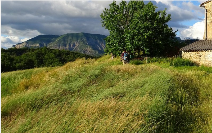
Le Verdillon (Office de Tourisme La Motte du Caire)