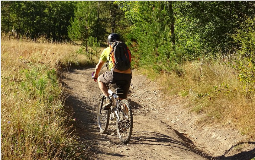
Un itinéraire principalement sur pistes (Office de Tourisme La Motte du Caire)