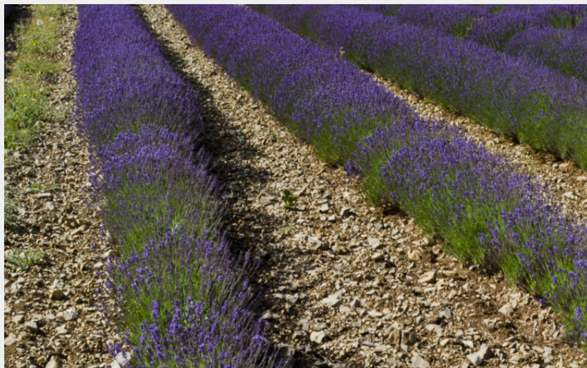
Plateau recouvert de lavande (CCSB)