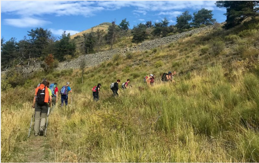
Durant l'ascension...