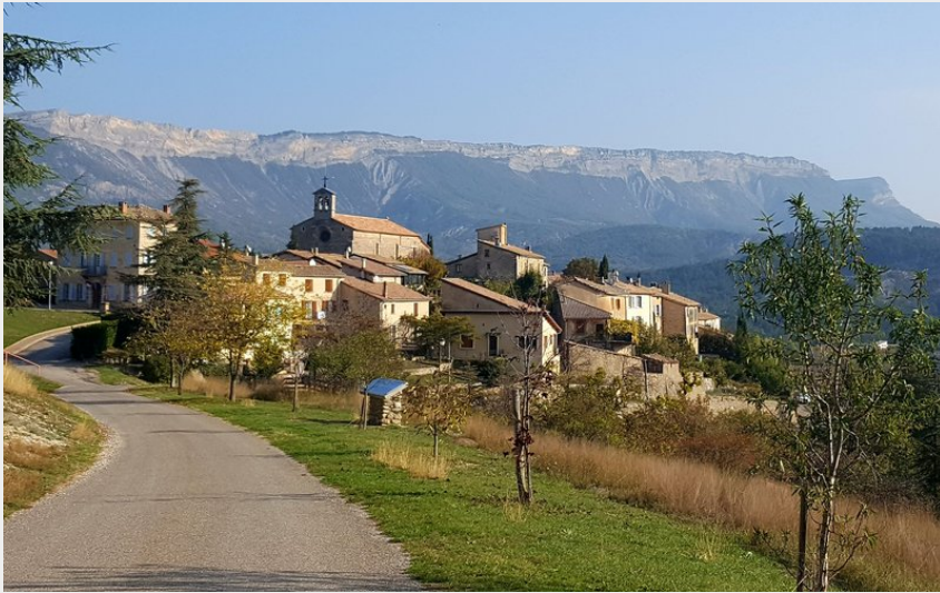
Village de Lagrand