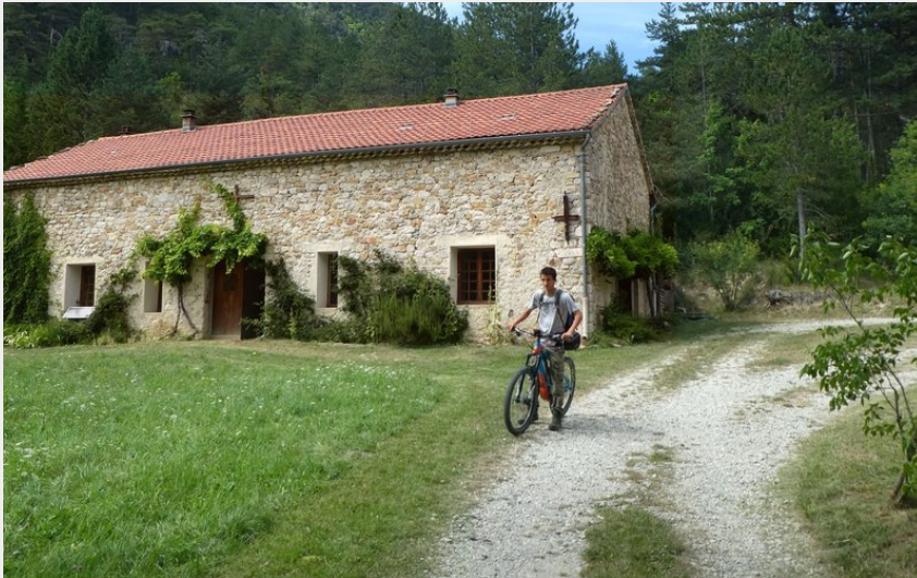
Portion sur piste (lucie.parmenier)