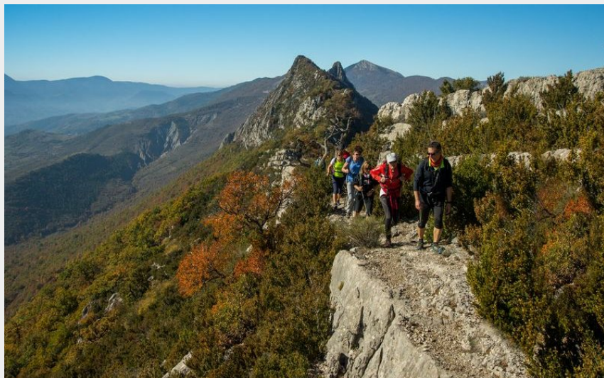
En route sur la crête ! (Espace Rando)