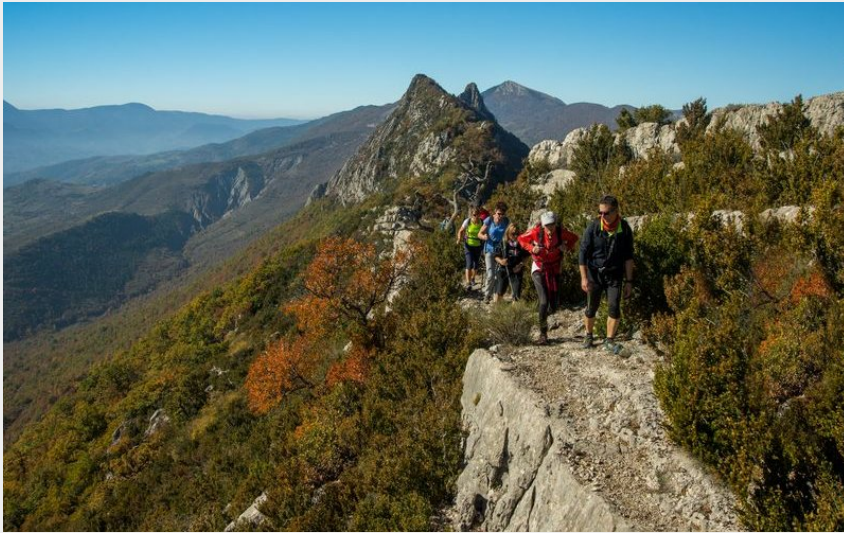
En route sur la crête ! (Espace Rando)