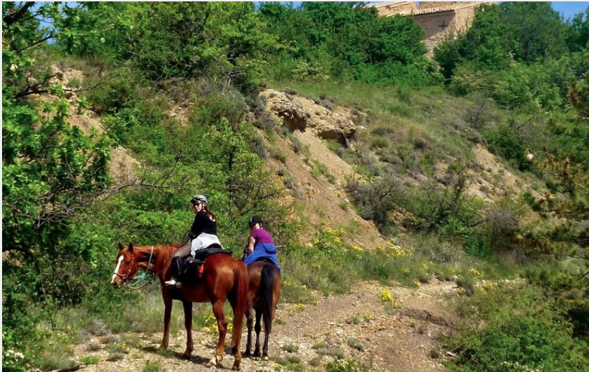
Montée d'Upaix (CDTE)