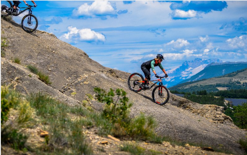
Parcours dans les marnes (CCSB)