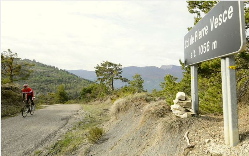
Au Col de Pierre Vesce (CCSB)