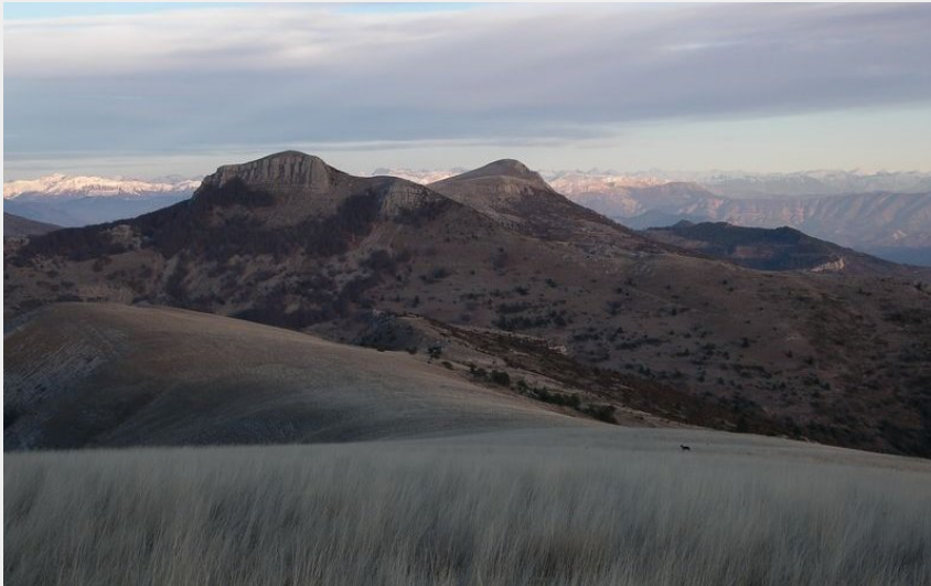
La Montagne de Mare