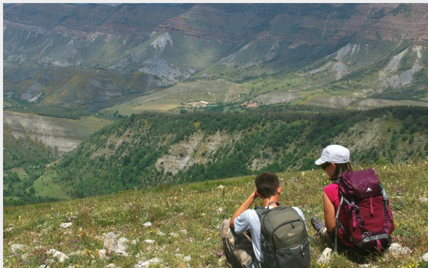
Col de la Sapie (1745 m) (CCSB)