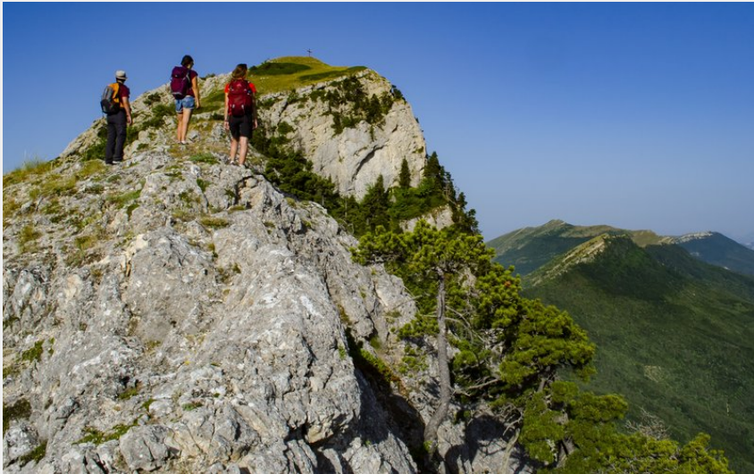
Un beau panorama à contempler (CCSB)