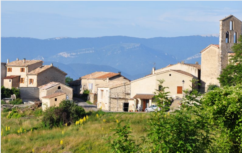
Hautes Terres de Provence (Office de Tourisme La Motte du Caire)