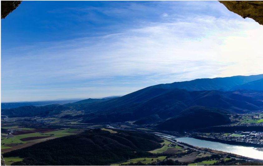
Trou de l'Argent (CCSB)