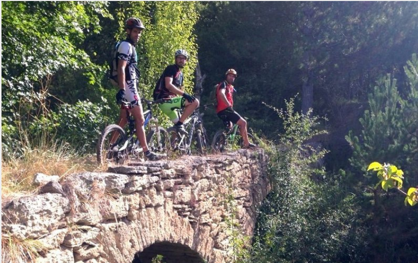
L'aqueduc (Office de Tourisme La Motte du Caire)