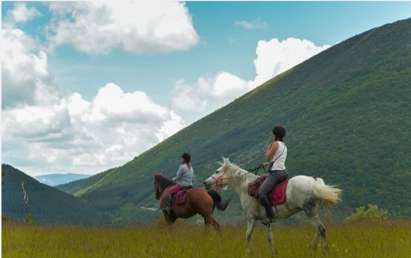
Paysages du Rosanais (CCSB)